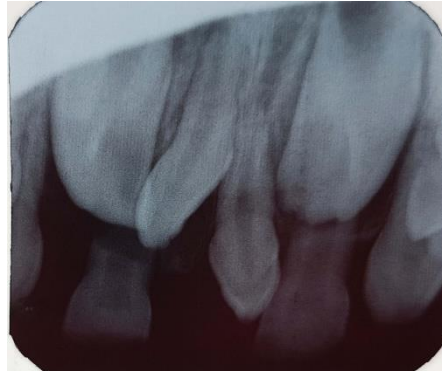
Figure 3: The CBCT showing the missed lateral permanent incisors and close position of the impacted mesiodens to the right permanent central incisor.