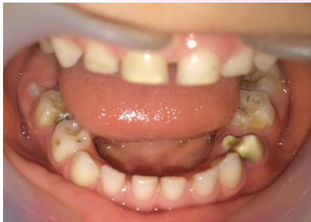
Figure 1: The intraoral clinical view of the patient in his first visit to the clinic.

the crown and early caries, the premolar tooth underwent indirect pulp treatment (IPC) and the crown was restored with glass-ionomer, followed by a periapical radiographic examination (Figure 3). The patient was followed every three months for two years. During the follow-up sessions, the patient underwent clinical and periapical radiographic examination of the affected tooth, and the glass-ionomer restoration was modified if indicated. Radiographic examinations during the follow-up sessions showed apical migration of the furcation, resulting in an increase in the occlusogingival height of the pulp chamber. These changes showed the formation of taurodontism in the affected tooth (Figure 4). Finally, an SSC was fabricated for the premolar tooth (Figure 5). The tooth is still functional and is continuing its development.