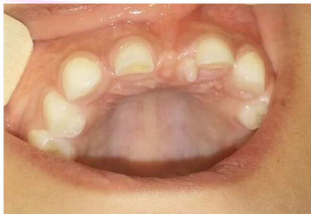
Figure 1: Intra-oral view of the maxillary arch. Note the diastema and the palatally erupted mesiodens.

repositioned and closed with 3-0 silk suture (Figure 4 and 5). After 1 week, when the patient returned for suture removal, an uneventful healing was achieved. The patient was recalled after 3 months to assess the central incisors for eruptive movements. The radiographic examination showed some corrections in the position of incisors but they were still not erupted due to the insufficient root development (Figure 6). Both central incisors erupted after 9 months but in a relatively rotate position (Figure 7). In order to manage the alignment of central incisors while considering the missing lateral incisors, consulting with orthodontics was considered. The result of consultation was to wait until the eruption age of permanent canines.