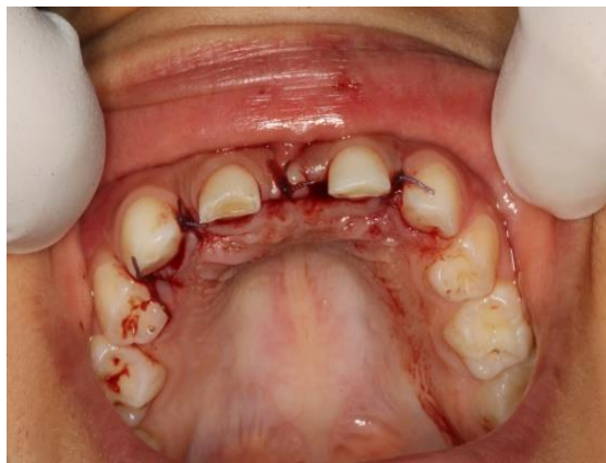
Figure 5: Both conical mesiodentes after extraction