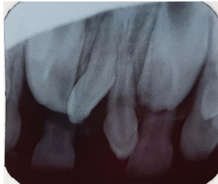
Figure 3: The CBCT showing the missed lateral permanent incisors and close position of the impacted mesiodens to the right permanent central incisor.