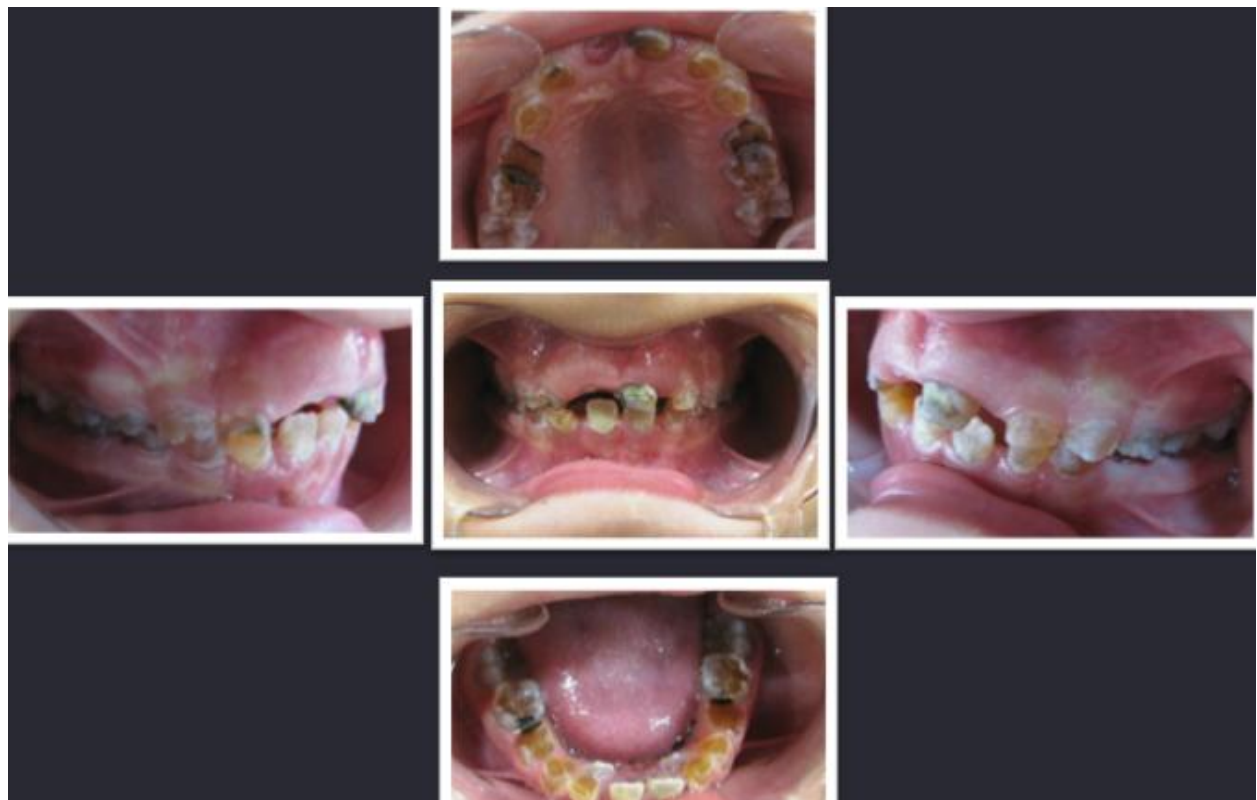
Fig1: Clinical examination

Periapical and panoramic radiographs showed features characteristics of DI. Bulbous crowns of the teeth and short and slender roots were evident. Pulp chambers were absent. It seemed that periapical radiolucencies were present around the apex of maxillary primary first molars and maxillary primary second molars. (fig 2 and 3)